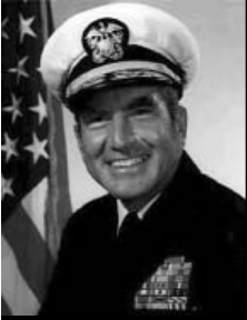
Admiral Elmo Zumwalt 1921-2000 Cause of death: mesothelioma