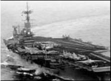
How many other Navy war veter- ans and enlisted men...