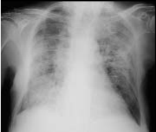
...have or will have lungs like this...